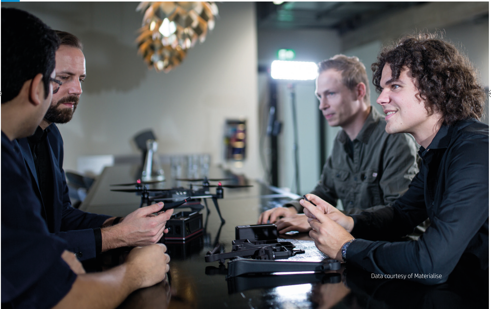
Data courtesy of Materialise